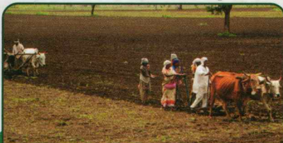
Scouting And Procure From Farms