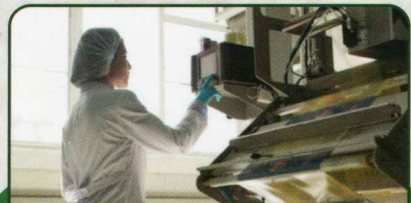
Processing in Our Specialised Machineries