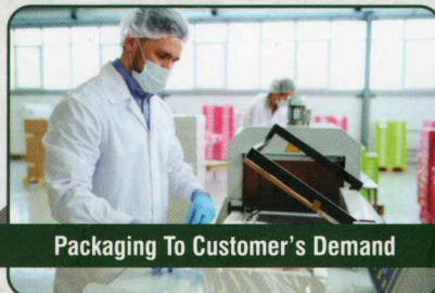
Packaging To Customer's Demand